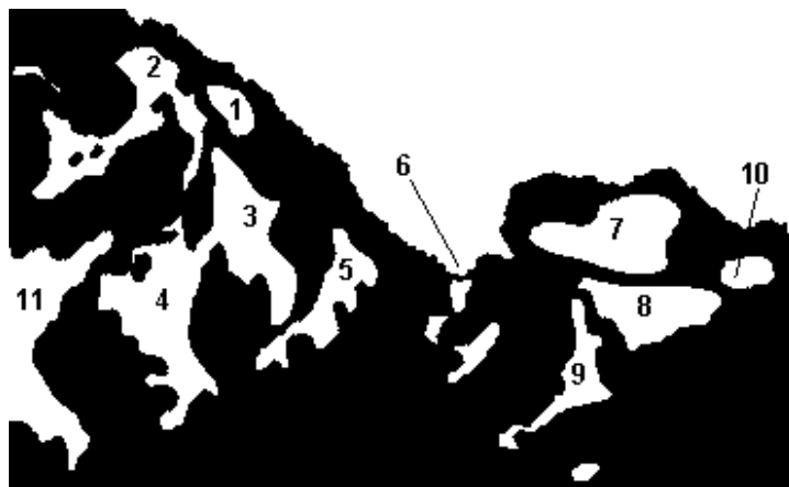
Fig. 3.5. Victoria's forest cover in 1869 derived from early survey maps showing the western portion of the Northern Plain. Sources: (Everett 1869) reproduced in Woodgate and Black (1988). Compare with Fig. 3.6. 1 - Kerang east, 2 - Kerang west and lower Avoca, 3 - Tragowel, 4 - Fernihurst, 5 - Patho, 6 - Echuca, 7 - Nathalia/Numurkah, 8 - Shepparton north, 9 - Shepparton west, 10 - Yarrawonga, 11 - Charlton.

In the Mid-Loddon area, grasslands occurred on the heaviest textured soils of the Riverine Plain that are elevated enough not to be subject to inundation (Table 3.2, Skene 1971), although some areas can become water-logged for brief periods by immediate run off after intense rainfall episodes. In contrast, where soils are subject to frequent and often prolonged inundation, woodlands of Eucalyptus largiflorens and E. camaldulensis , and shrublands of Muehlenbeckia florulenta tend to occur (Table 3.2, Skene 1971). In some areas, M. florulenta shrublands have been described as part of the broader “treeless plain” landscape unit (Skene 1971), but because they are subject to frequent flooding the vegetation is never dominated by perennial native tussock grasses. Woodlands dominated by E. microcarpa , E. melliodora and Allocasuarina luehmannii , and occasionally mallee eucalypt shrublands occur on relatively lighter textured soil both on and off the Riverine Plain, although these can be replaced by E. largiflorens , E. camaldulensis or Muehlenbeckia florulenta dominated wetland vegetation when subject to inundation (Table 3.2, Skene 1971).